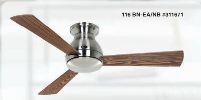
116 BN-EA/NB #311671