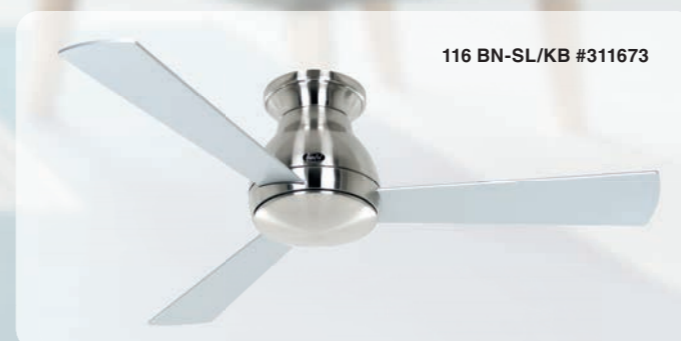
116 BN-SL/KB #311673