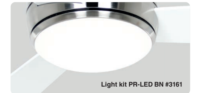
Light kit PR-LED BN #3161