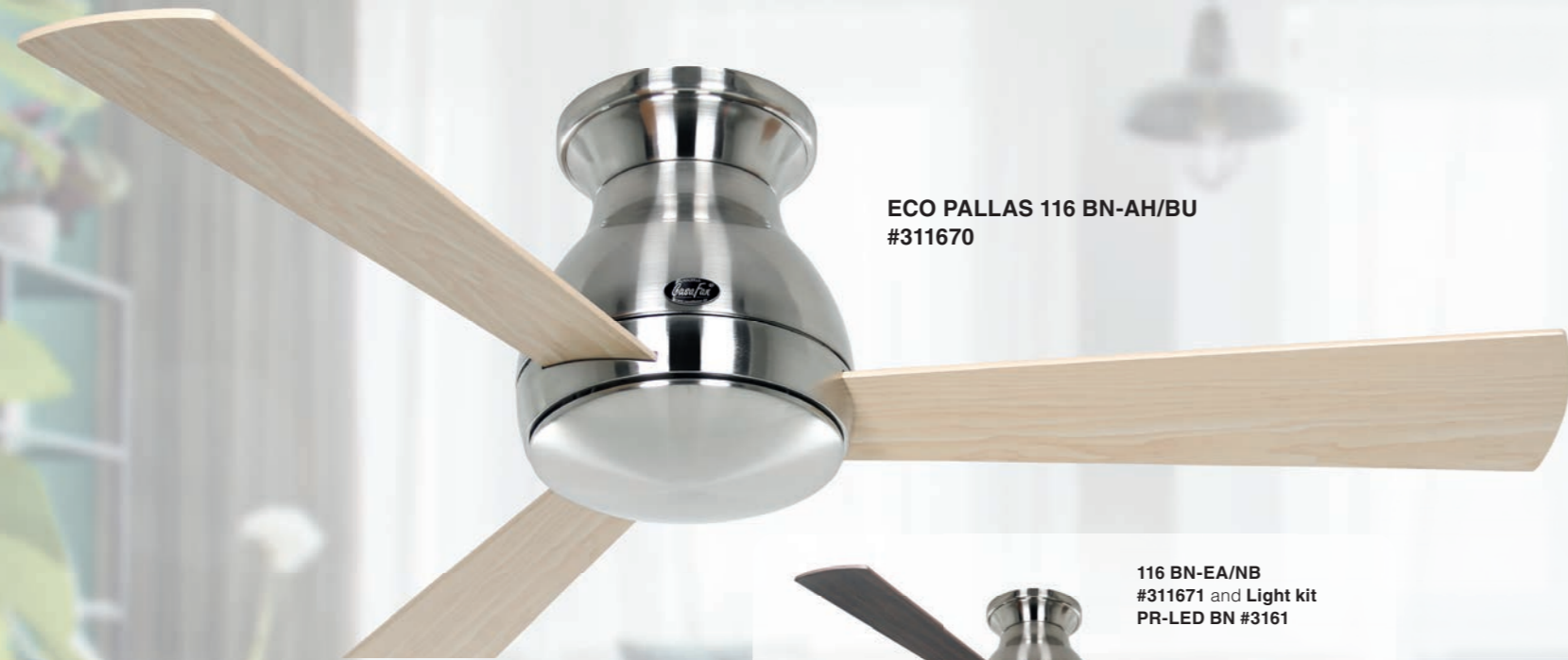
ECO PALLAS 116 BN-AH/BU #311670