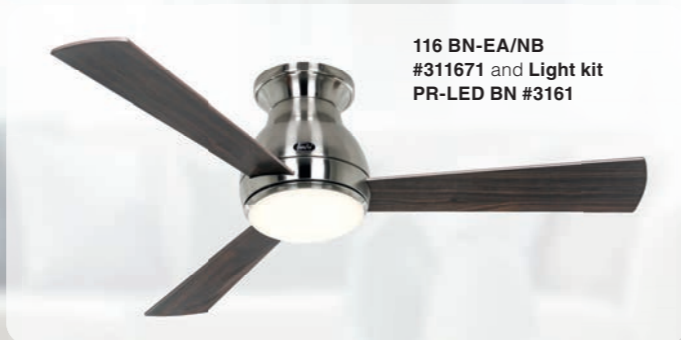
116 BN-EA/NB #311671 and Light kit PR-LED BN #3161