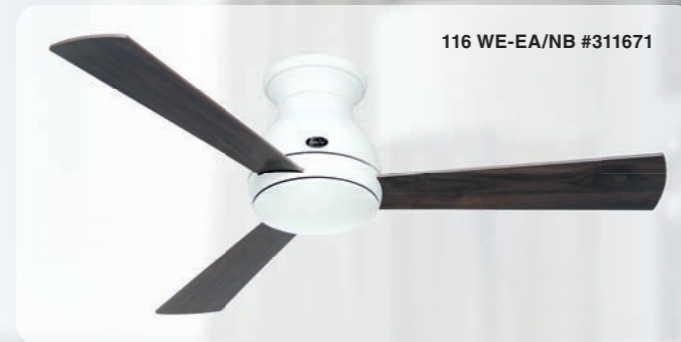
116 WE-EA/NB #311671