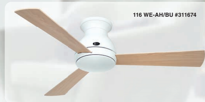
116 WE-AH/BU #311674