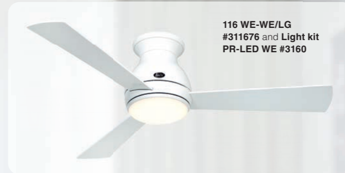
116 WE-WE/LG #311676 and Light kit PR-LED WE #3160