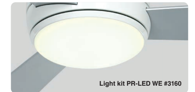
Light kit PR-LED WE #3160